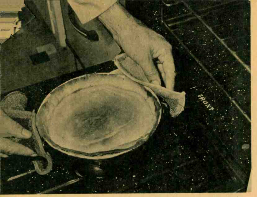
TEMPTING SIGHT when it emerges from the oven is this bowl of hidden hash topped by Yorkshire pudding. Hash is concocted from left-over roast, chopped onions, diced potatoes, carrots and celery.