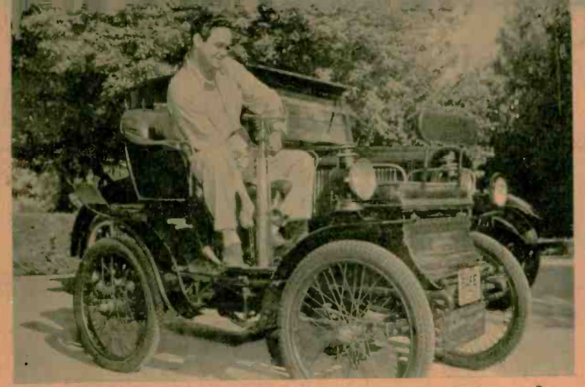
THIS IS THE FIRST CAR registered in Connecticut—a De Dion Motorette, 1898 model. Melton also possesses the 1908 Fiat with plum-colored upholstery and sterling silver littings, originally owned by labulous Diamond Jim Brady, and a horseless stage coach that a millionaire had built in 1893.