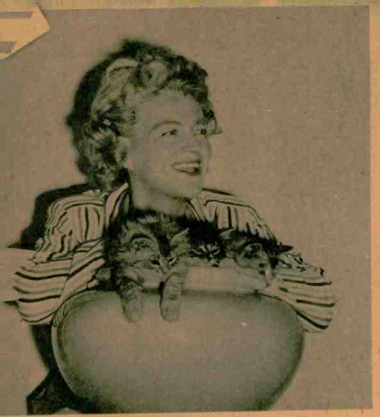
THREE LITTLE KITTENS, part Persian; the mother cat, a Chow dog, some prized birds, a few fish and a coopful of chickens inhabit the spacious grounds at Gracie Fields' Santa Monica home. The house has a colorful patio and swimming pool, where the neighborhood children frequently come in to piay at Gracie's invitation.